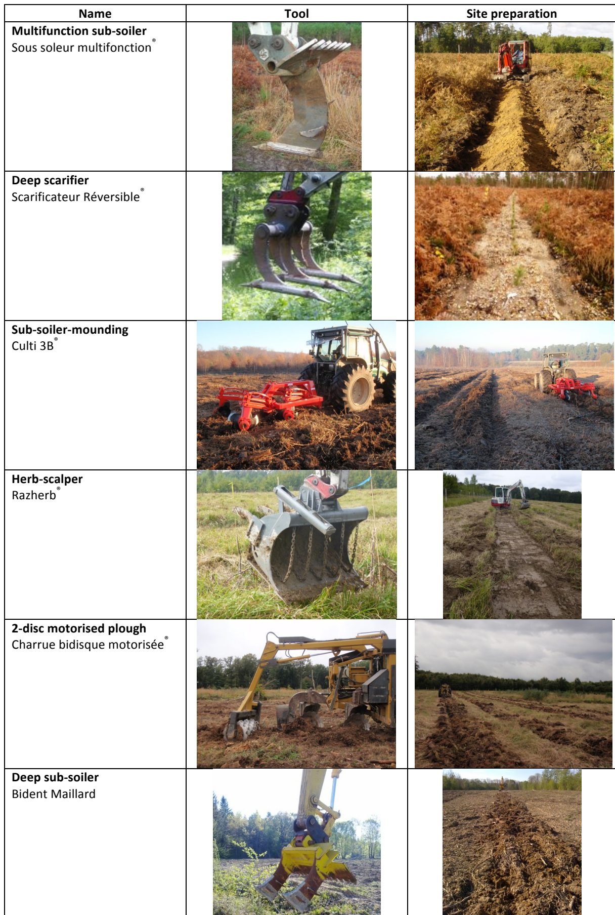
Table 1 : Main tools tested in the ALTER and PILOTE experimental networks.